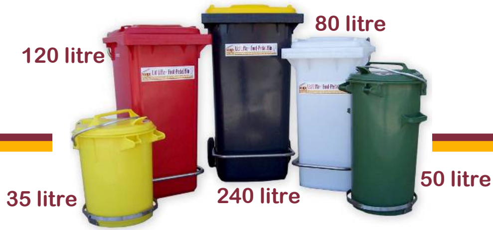
Bin colours & (inter-changeable) Lid colours